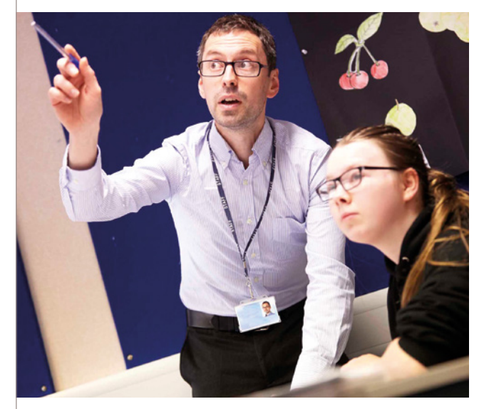
An employability lesson at Derwentside College

In summary, as a college we have found that the combination of extra time spent with learners with SEND, investing in staff with extensive SEND experience and adapting and creating careers resources specifically for learners with SEND has helped us to meet the needs of all of our learners in the college as they progress into the world of work.