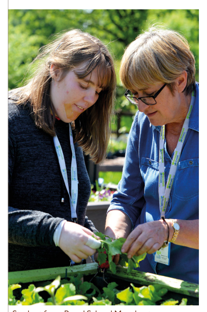
Student from Royal School Manchester learning about horticulture