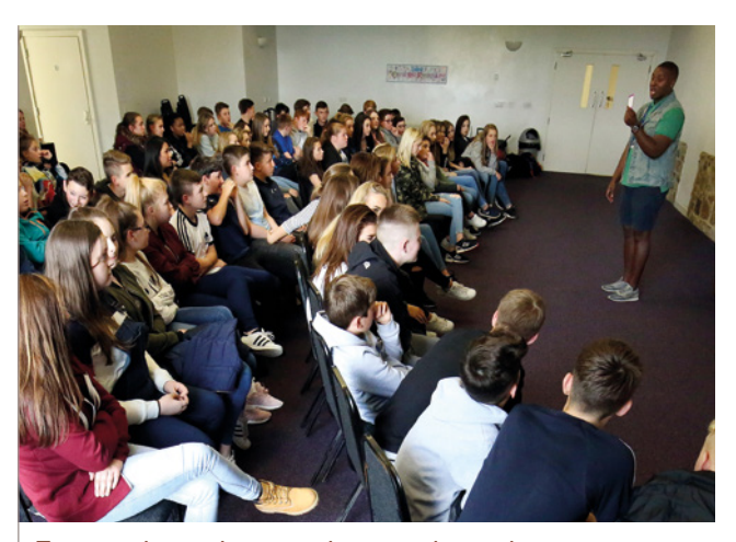
External speaker working with students from St Joseph's Catholic Academy

In our sixth form we have a student whose goal has always been to go to university. Due to her physical disability she uses a wheelchair, and is unable to write or carry out many tasks other students take for granted. She had always attended specialist provision but during her GCSE years she was proactive in getting in touch with local schools that could offer A-levels. However, although she had no learning difficulties, there was a clear gap in provision in our local area for students with these types of physical disability. I felt that we could meet the needs of this student,