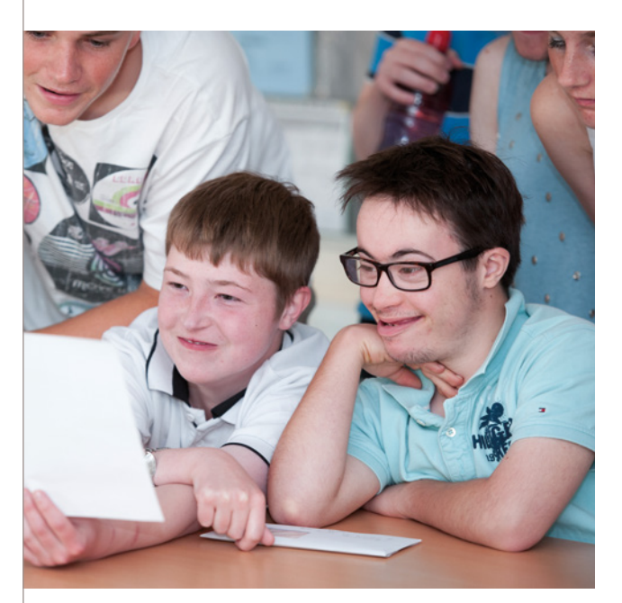
Students from Brookfields School engaged in classroom-based career coaching sessions

You can encourage all stakeholders, including non-experts, to contribute to the early career development of young people with SEND. Through the framework of the Gatsby Benchmarks, you can work together with each young person and their parents and carers to set objectives, minimise barriers and support them effectively towards a positive career outcome.