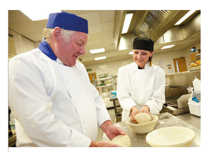
A catering course at Derwentside College