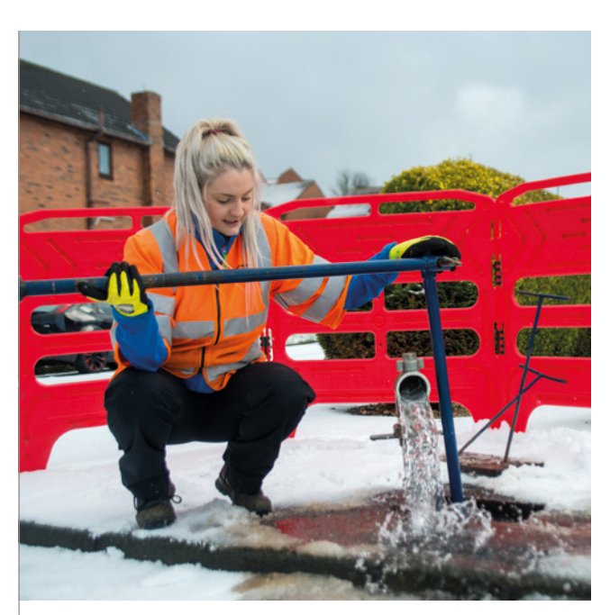
Northumbrian Water employee at work

schools need from an employer, what works and what doesn't. I also wanted to learn how to achieve better long-term outcomes when we welcome those with different needs into our workplace.